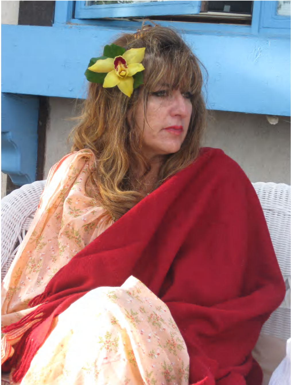
Dec Newsletter 2010