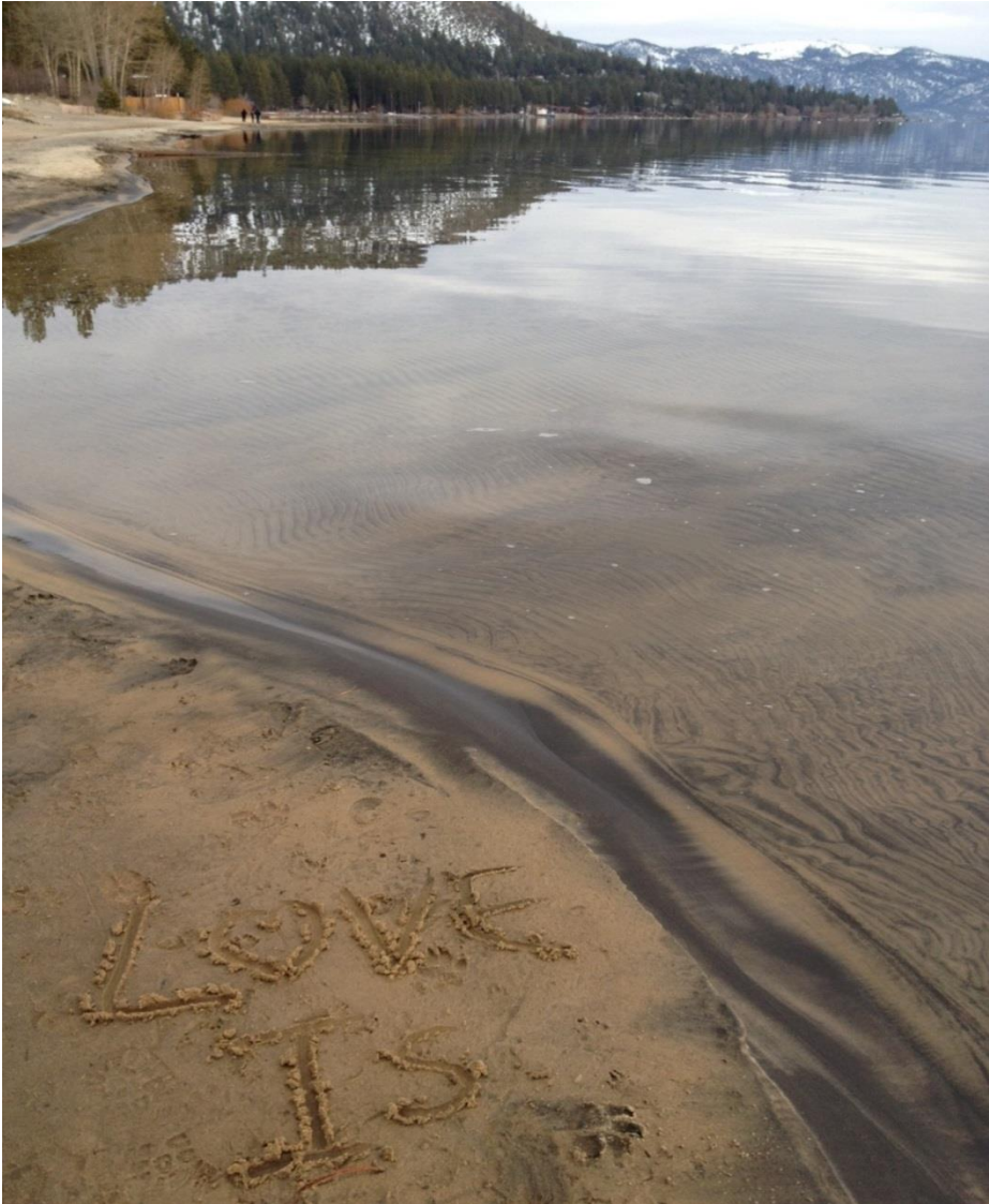
Sathyam, Winter 2013, Lake Tahoe